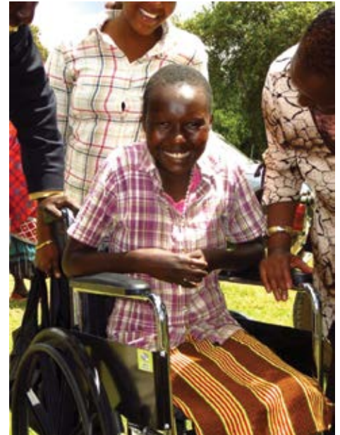
Another Joyful Recipient